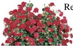
Red (item #13)