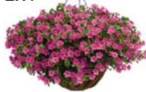
Pink (item #6)

Mixed Color Calibrachoa Baskets Many Striking Combos Growers Choice (item #7)