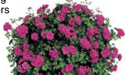
Lavender (item #14)

Beautiful flower clusters on trailing plants of ivy shaped leaves. Prefers part sun / part shade locations.