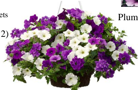
Plum (item #11)

Mixed Color Petunia Baskets Many Striking Combos Growers Choice (item #12)