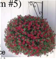
Red (item #5)

Greatly improved over million bells, These Proven Winner Brand Calibrachoa Have superior summer full sun performance that truly make them SUPER!