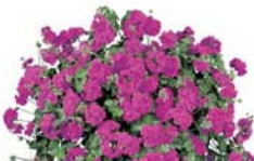
Pink (item #15)