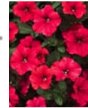
Red (item #8)