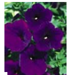
Blue (item #9)