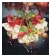
Swing Time (item #17)

Gorgeous fully double hanging flowers that bloom all summer. Bright-diffused light out of direct sunlight.