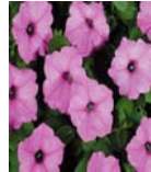
Pink (item #10)